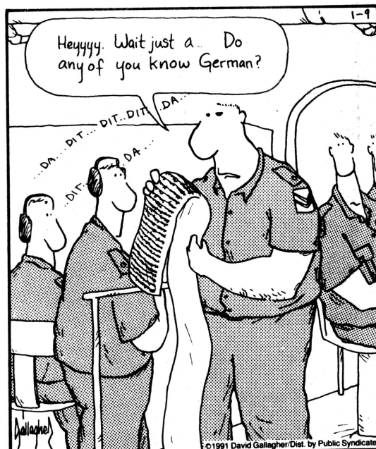
After countless hours of work, the World War II secret communications unit finally cracks the enemy's code.